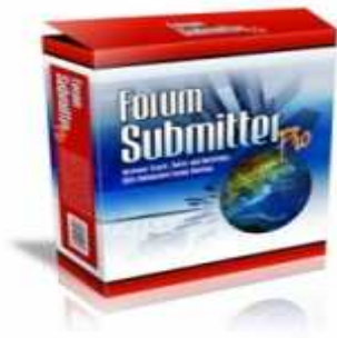
Forum Submitter Pro

All you need to do is decide on your message, choose which forums and sections you wish to post it to and whether you want an instant notification of any replies by e-mail and then pushed the button. Forum Submitter Pro will take it from there.